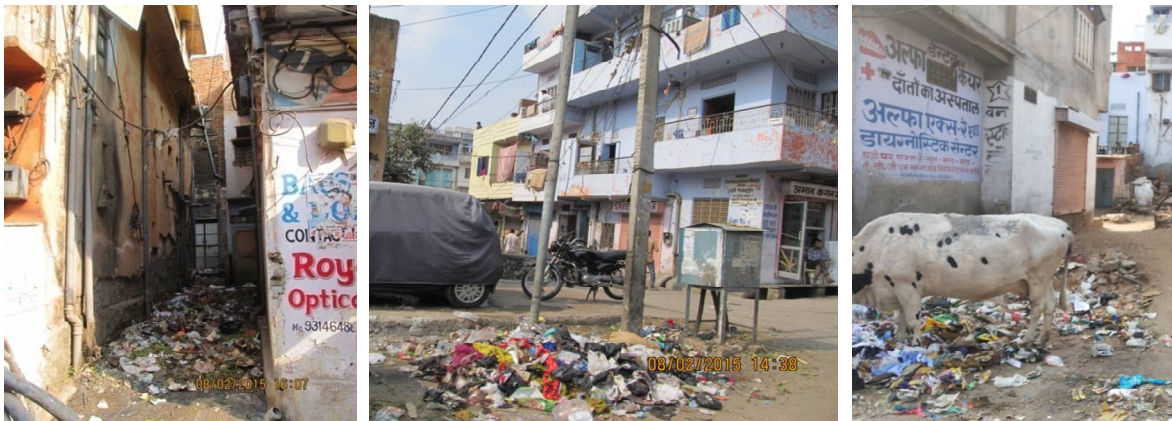
Figure 2 Poor waste management in Jaipur city

Due to several legislative, environmental, economic and social constraints, the identification of the most sustainable disposal system for MSW is most important for Jaipur city. In addition, the management of the MSW needs to revamp to accommodate the changes in its quantity and quality to ensure the longevity of the environment.