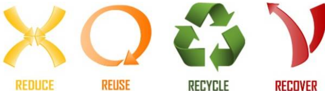
Figure 3 4R's Concept of integrated waste management

Various issue of waste management and consumption habits of modern consumer lifestyles are causing a huge worldwide waste problem, having a devastating impact on ecosystems and cultures throughout the world. Hence waste management is utmost important with 4R's concept i.e., Reduce, Reuse, Recycle and Recover.